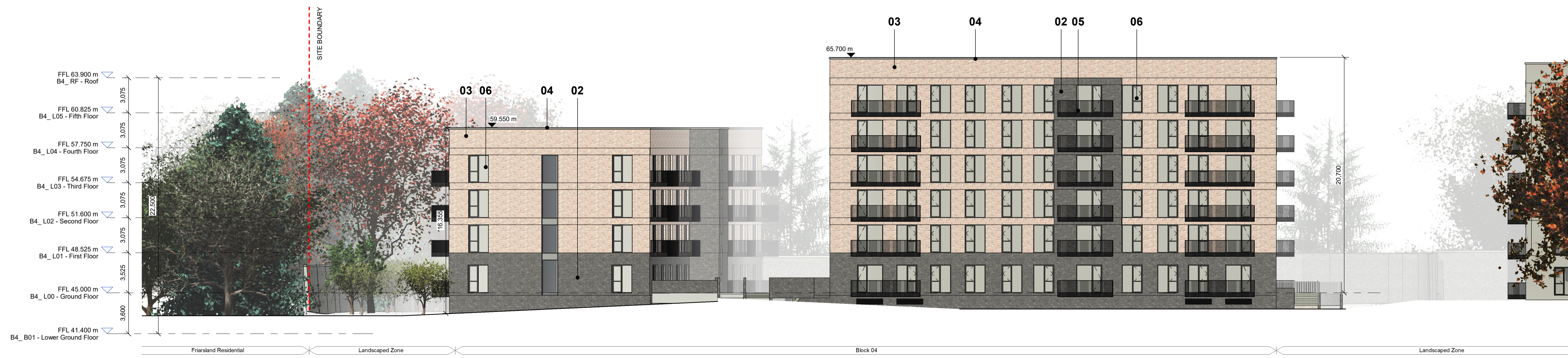
Block 04, North Elevation 1 : 200

Notes: - Do not scale from this drawing. Use figured dimensions in all cases. - Verify dimensions on site and report any discrepancies to the Architect immediately. - This drawing is to be read in conjunction with the Architect's Specification. - © This drawing is copyright and may only be reproduced with the Architect's permission.