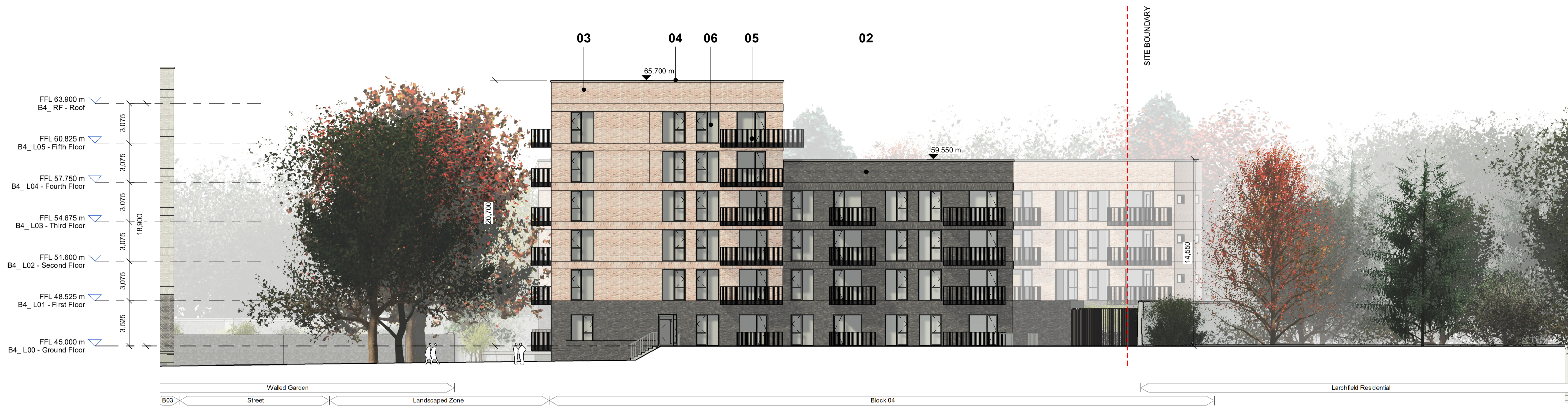
Block 04, West Elevation 1 : 200